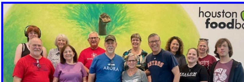
Volunteers to work in the Houston Food Bank warehouse Tuesday, June 18