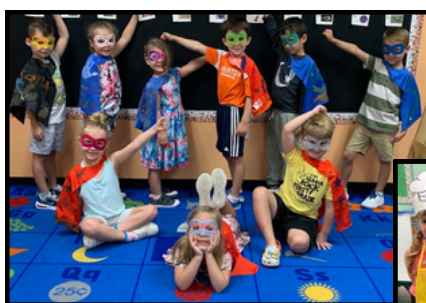
Scenes from CLC Summer Camp, June