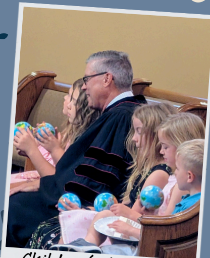
Children's Moment Where does God live?