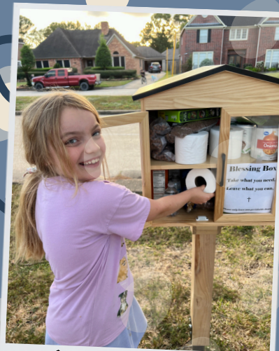
Adding to the Blessing Box