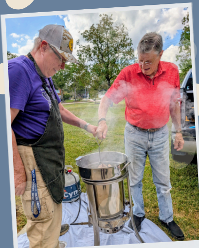
Frying the Turkey For Thanksgiving