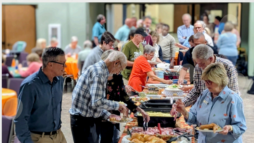
Church Supper Nov 12th Happy Thanksgiving