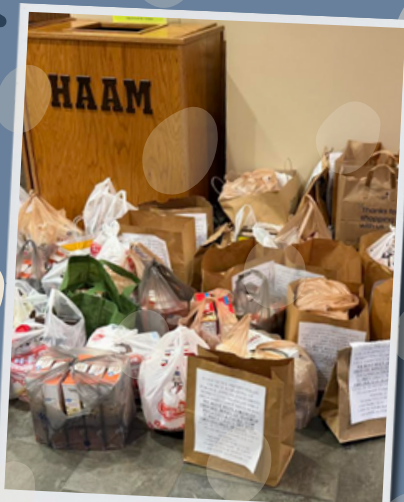
HAAM Donations Thank you!